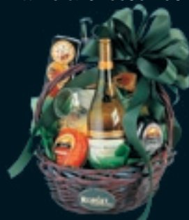
Wine & Cheese Basket